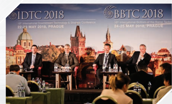
Expert's Interactive Discussion Session